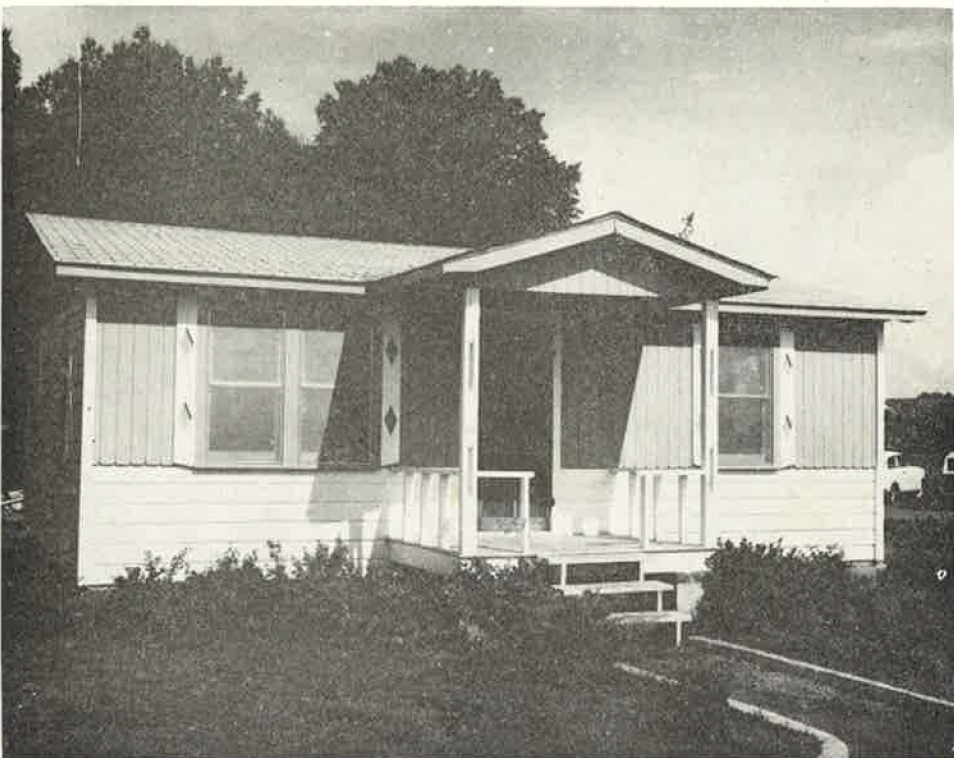
CAPRI WITH PORCH AND VERTICAL SIDING