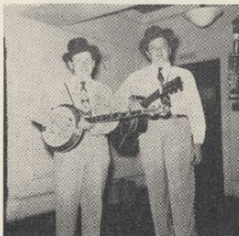
The Stanley Brothers before broadcast WRVA Richmond Va.

Now when you are tired your new love's gone down I hope you'll return, I'll still be around I love you so well you know I will wait Just remember these words, it's never too late.