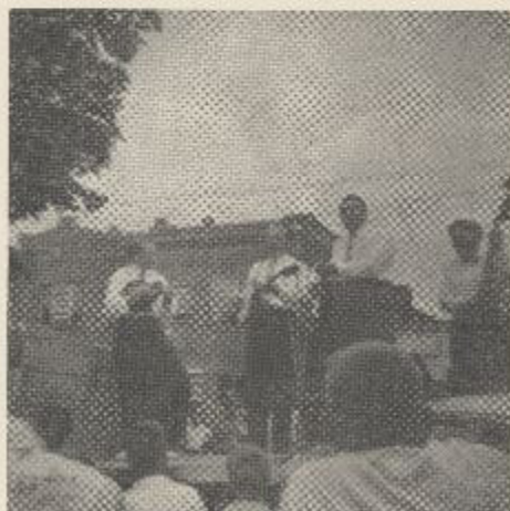
Stanley Brothers playing an out door show at St. Paul Va.

When I left her all alone in our little mountain home No thoughts of the day I'd return Now I'm coming back to you love I know you've been true And I'll swear sweetheart I've lived and learned.