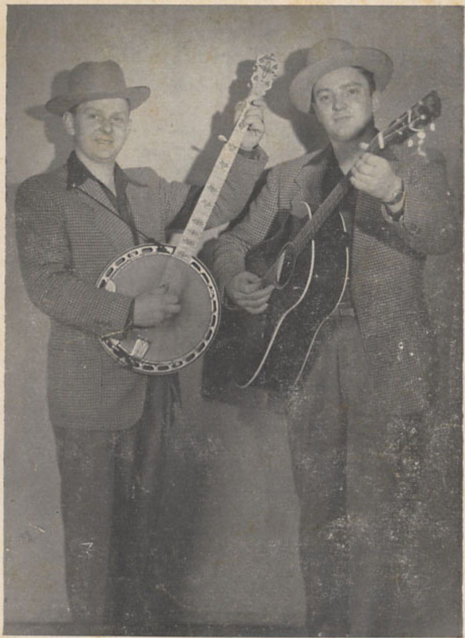
The Stanley Brothers